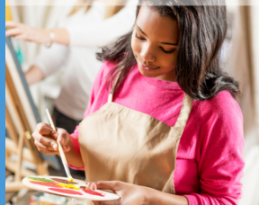
Summer Art Intensive