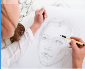
Summer Art Intensive