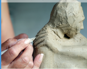
Summer Art Intensive