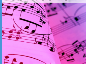
Summer Music Intensive