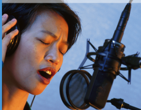
Summer Music Intensive