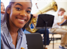
Summer Music Intensive