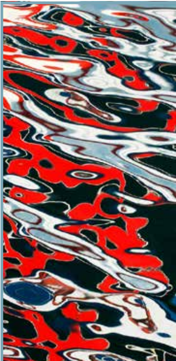
Barbara Vaughn, "Kinitos," 2012, Pigment Print on Cold Press Rag Paper 340 GSM, 60" x 40"