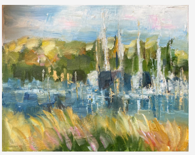
Adele Wallach & Janet Fink at Riverhead Town Hall August 2nd - September 10th