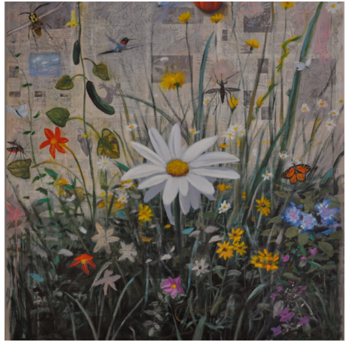
OLD NEWS: IN THE GARDEN, 2017, oil and graphite on newspaper transferred and adhered to canvas, 60 x 65 x 2 in. 152.4 x 165.1 x 5.1 cm.

Adam Straus is known for his majestic and luminous depictions of the sublime in his paintings, which are often saturated with a deep concern about social and environmental issues. His penetrating dark humor can transport the viewer to post-apocalyptic worlds and often offers a wry observation on how humans have altered the natural landscape. A monograph on his work was published by Gli Ori, Italy, in 2016, with an essay by author and critic Amei Wallach who writes that "The tradition into which Straus dared to tread ... was sorely in need of reanimation. His disruptions in the years since have unsettled received assumptions as much through dark humor and bravura painting as through offering a reassessment of what it means to paint the beauty of nature in ugly times. It is important to him that his paintings are accessible... But that is only the first, skin-deep level, and it is animated by compound subterranean layers of passionate conviction, cosmic yearning, and comedy." Work by Adam Straus is numerous museum collections including the Parrish Art Museum, Bridgehampton, NY; List Visual Center, M.I.T., Cambridge, MA; Butler Institute of American Art, Youngstown, OH; The Art Museum at F.I.U., Miami, FL; Mead Art Museum, Amherst, MA; Tufts University Art Gallery, Somerville, MA; and the William College Museum of Art, Williamstown, MA, among others. Straus lives and works in Riverhead, NY.